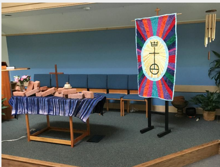
Peace Church's Tiny House Initiative